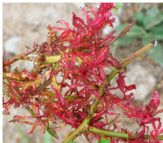
Red, elongated stem growth