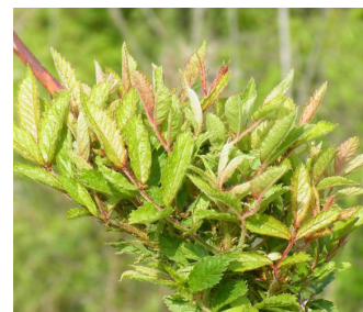
“Witch’s broom” cluster

This document does not represent an endorsement of the chemicals listed above.