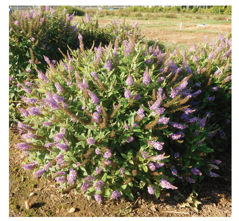
Fig 3: Re-bloom on in ground planting of Dapper® Lavender in October in PA