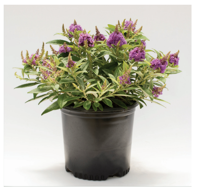
Fig 1: Finished container of Dapper<sup>®</sup> Lavender Buddleia