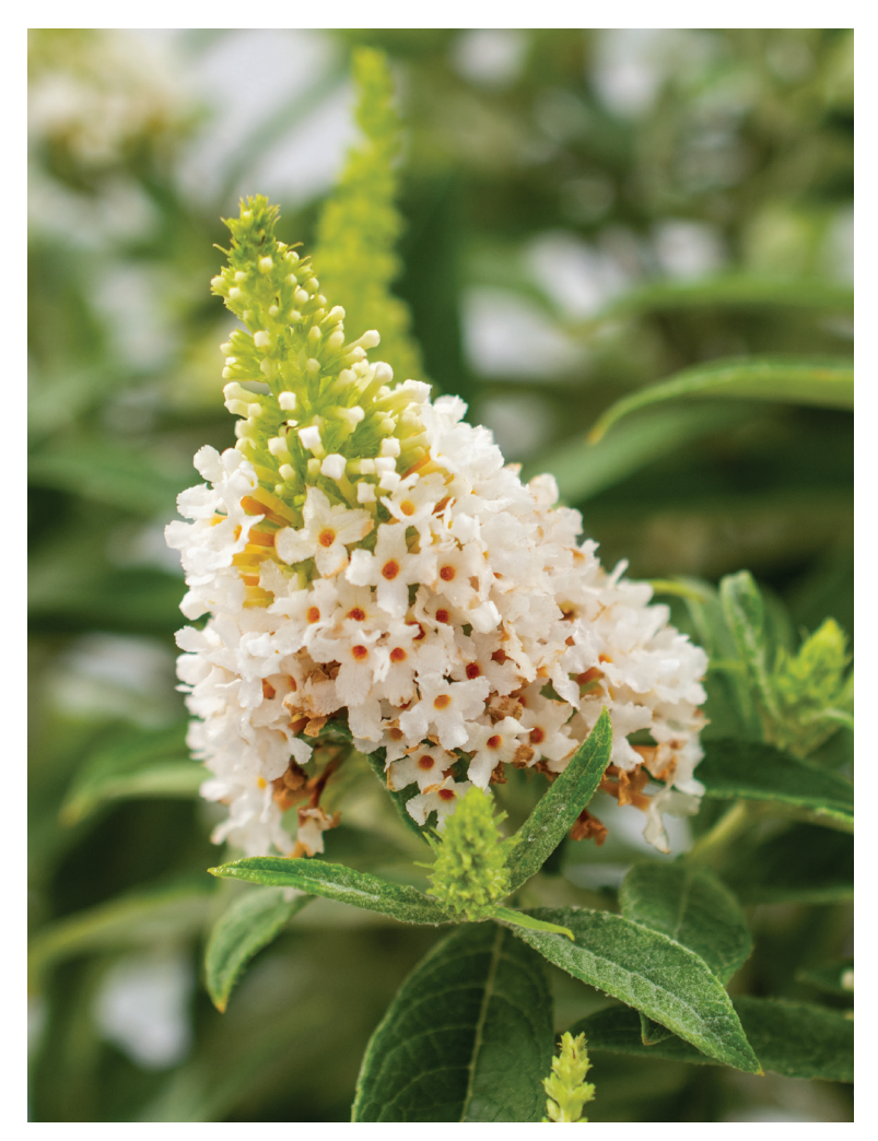
Fig 2: Flowers of Dapper<sup>®</sup> White Buddleia