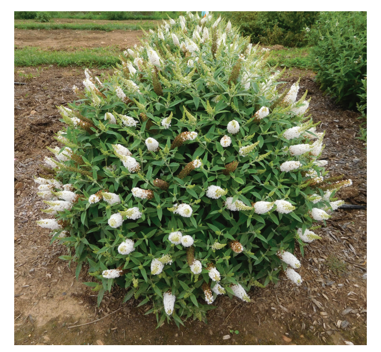
Fig 3: In ground planting of Dapper<sup>®</sup> White Buddleia