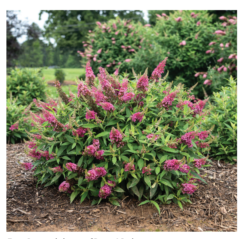
Fig 1: In ground planting of Dapper® Pink.