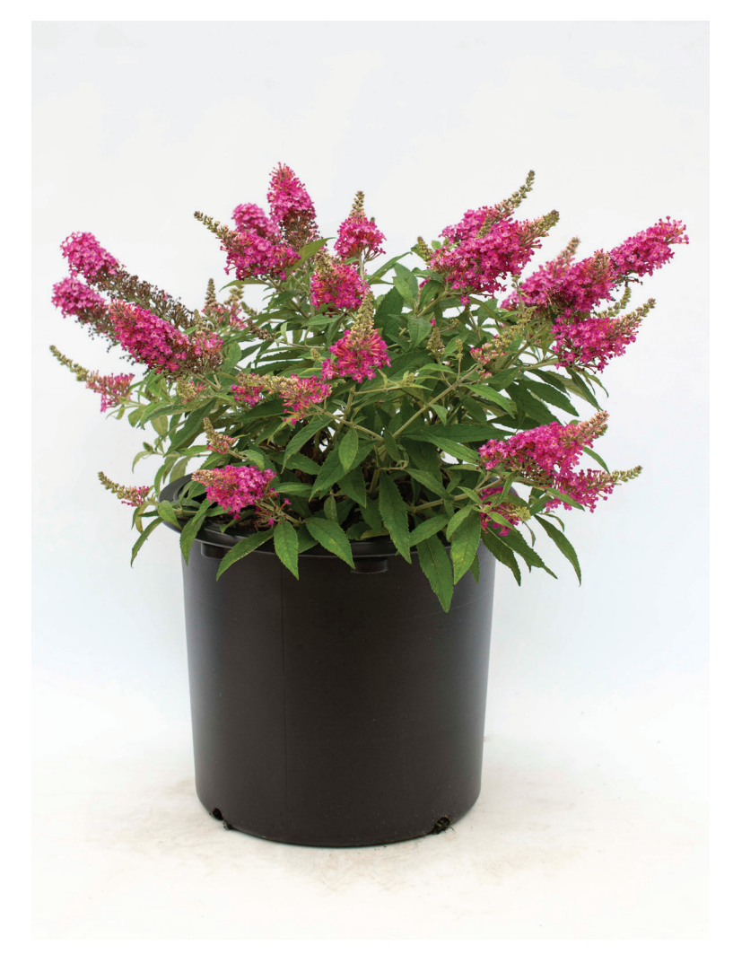
Fig 2: Finished container of Dapper® Pink.