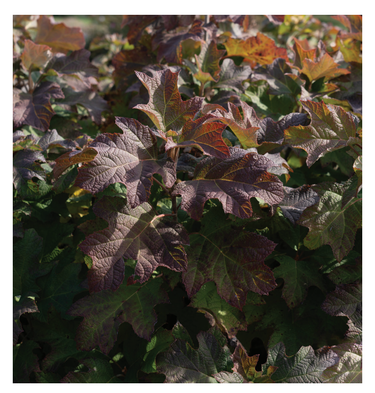
Fig 3: Fall foliage of Autumn Reprise<sup>™</sup> Hydrangea.

• Transplant bareroot in Feb–March, saleable in June–July