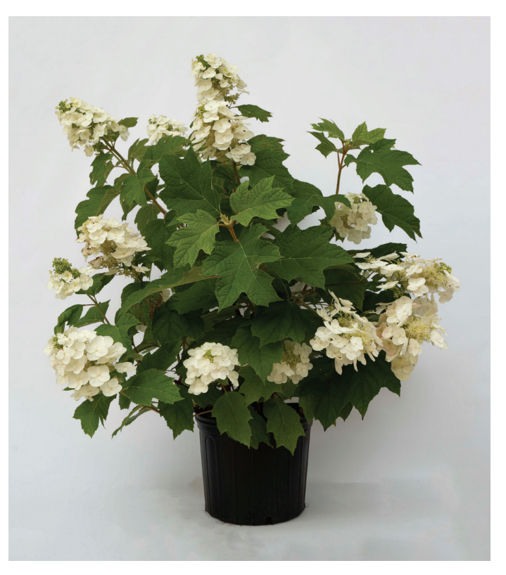
Fig 4: Finished container of Autumn Reprise™ Hydrangea.