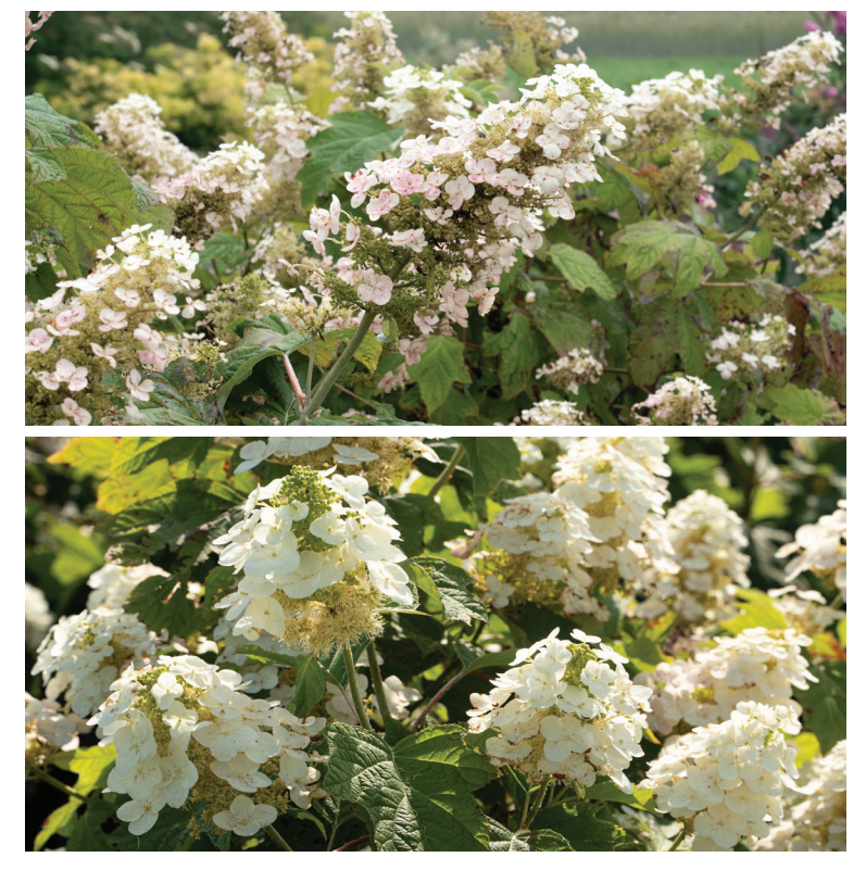
Fig 2: Blooms of Autumn Reprise™ Hydrangea.