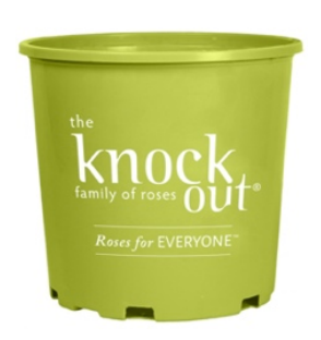
The Knock Out® Family of Roses® mandatory container

Any plant sold in a 3.5-gallon or greater size container must meet or exceed the 3-gallon minimum specifications and pricing.