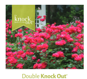
**RADTRO" PP 14,384 CFBR 3,364 **Roses for Everyday.** Everyone. Everywhere.** THE BEST floreining ideal EASY CARE EVERYORE.** FLOWERS FLOWERS