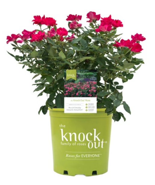
Compliant use of Knock Out® Roses mandatory container and tag